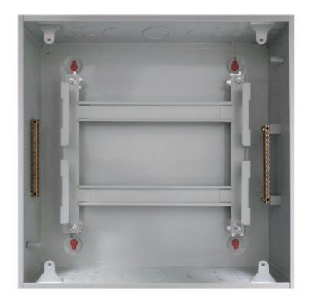
Zero and ground terminals included